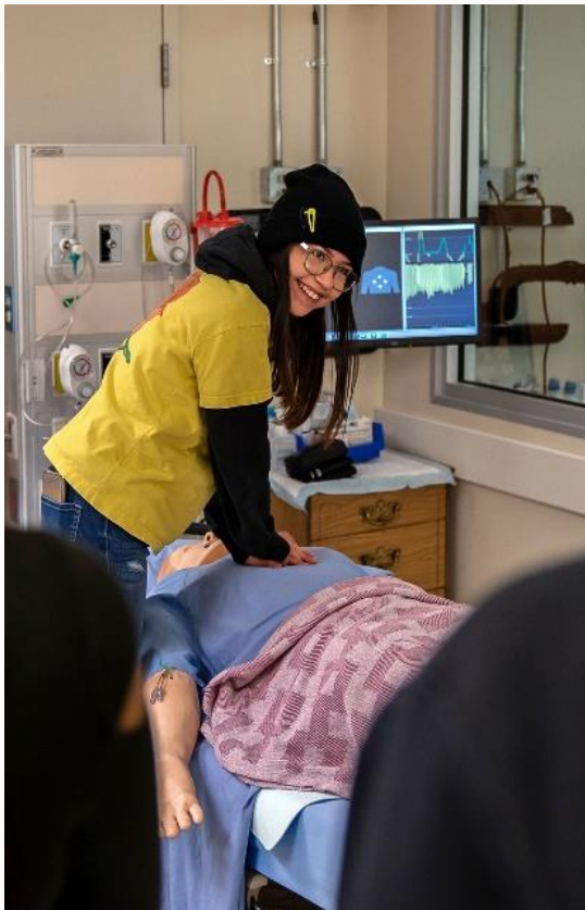
Image 1: A student from Siksika Nation practices chest compressions in the Clinical Skills Lab during the Feb 2019 Mini Med