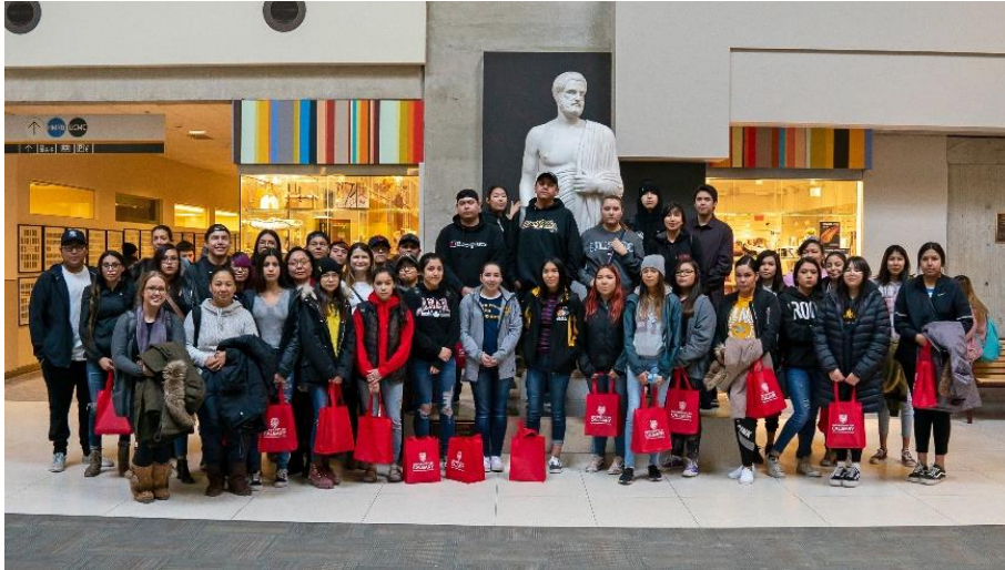
Image 2: Students from Siksika Nation visit the Cumming School of Medicine for a Mini Med event in February 2019