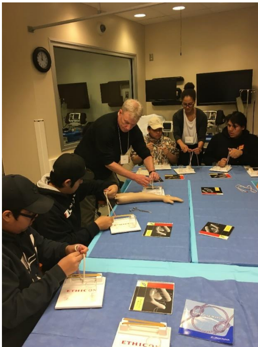
Image 3: Students from Morley Community School learn knot tying techniques during the Dec 2019 Mini Med