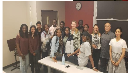
COMMUNITY ENGAGEMENT — LOCAL & GLOBAL