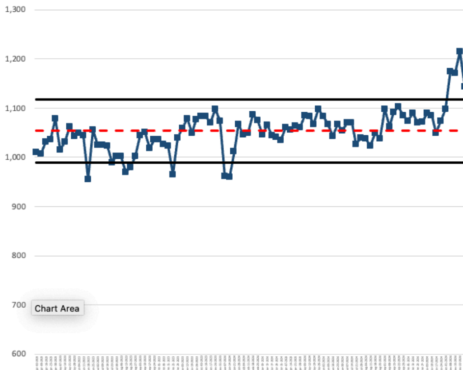
Total Mean Daily Visits: Calgary Urban

1) A visually significant increase in the Total Mean Daily Visits to Calgary Urban ED over the holiday season (also note this sort of spike was not seen in Dec 2023) and