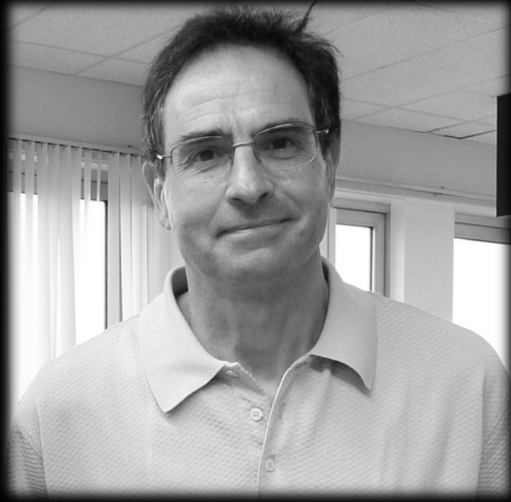
Norm Campbell Health Research Foundation Medal of Honour