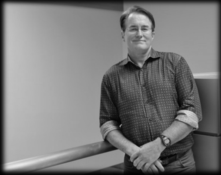
Paul Beck Killam Annual Professorship