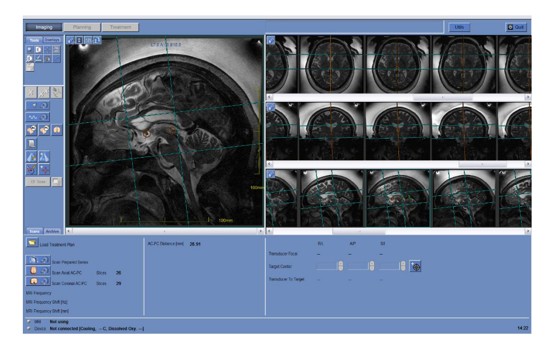
Figure 1: Exablate Software Graphical User Interface: 1) Graphical user interface uses buttons and icons to identify functions during treatment, 2) the software overlays graphical displays on MR image(s), 3) treatment parameters and treatment progress easily accessible during treatment.

A series of MR images is taken for the purpose of planning the treatment. The physician will mark the area to be treated and sub-lethal sonications can be used to illicit physiological responses from you to ensure they have located the proper spot in the brain.