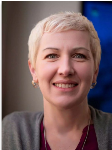
The effects of prenatal cannabis exposure on maternal and infant health