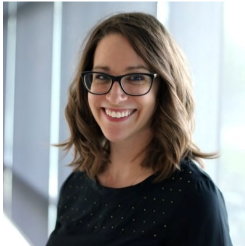
CMA Award for Young Leaders, early career & Resident Doctors of Canada (RDoC) Puddester Award for Resident Wellness