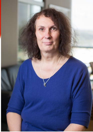
2021 Meridith Marks Mentorship Award at Memorial University