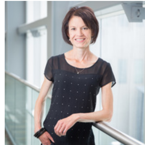
CNS Early Career Researcher Partnership Prize