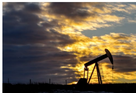
File: Pumpjack at oil industry against cloudy sky during sunset.

By Bill Graveland · The Canadian Press Posted April 6, 2022 7:48 am