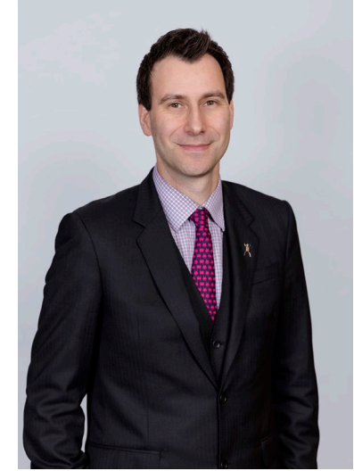
Killam Annual Professor Award