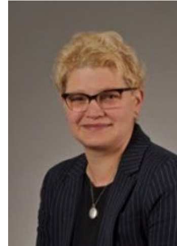
Radical Mental Health Doulas: An Innovative Model of Support for Women with Mental Health Challenges