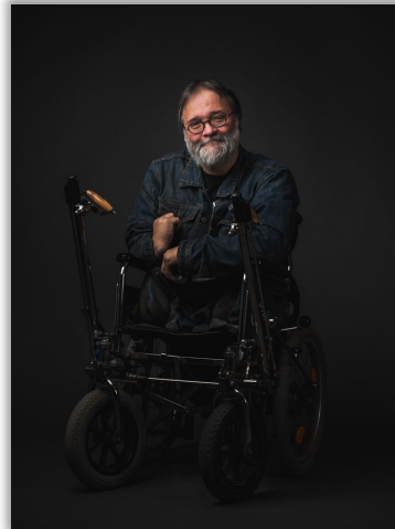
Innovative Approaches to Research in the Pandemic Context