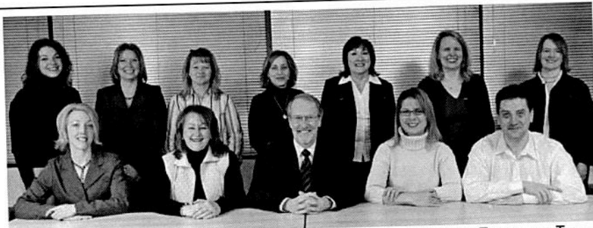
Dialectical Behaviour Therapy Treatment Team