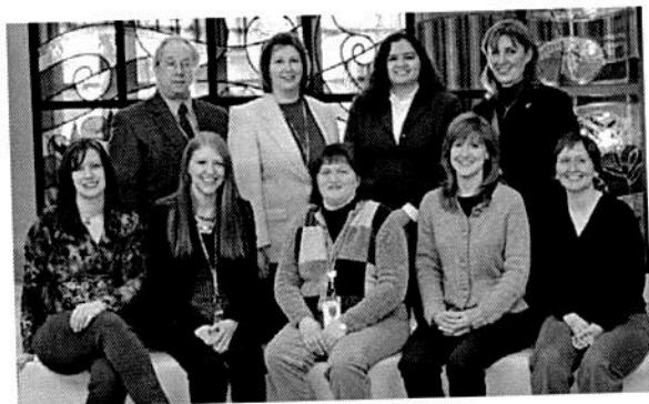
Healthy Minds/Healthy Children Outreach Team