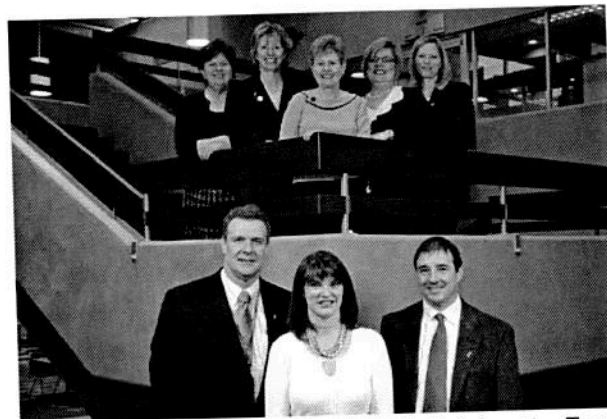
Complex Kids Collaborative Team