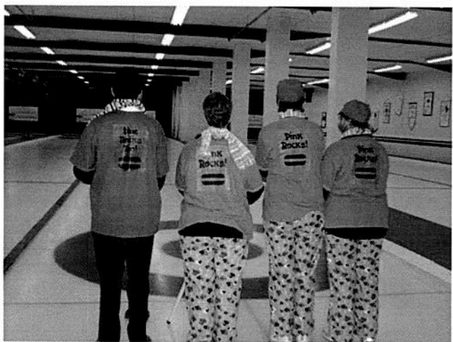
Winners of "Best Dressed Team" - Pink Rocks!