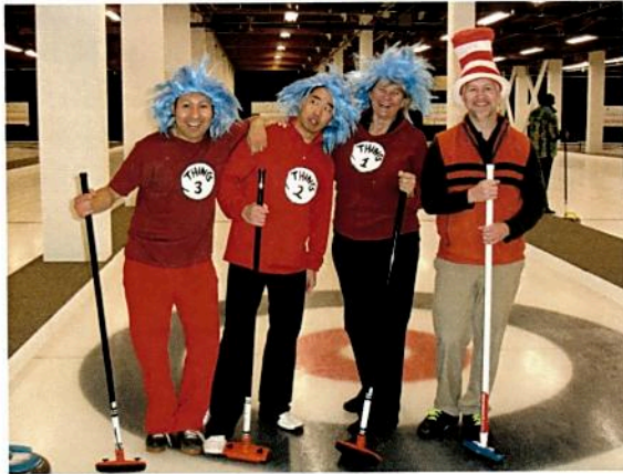
Highest Score - "Curlamajiggers"