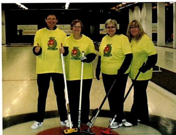
Best Team Name - "Sheet Disturbers"