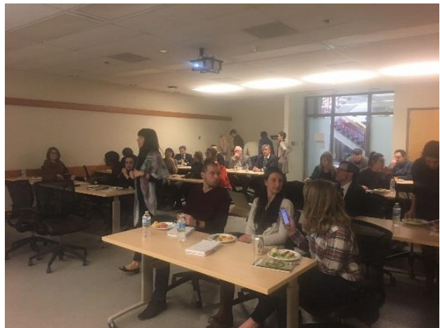
(Impressive attendance and participation at Mathison Rounds)