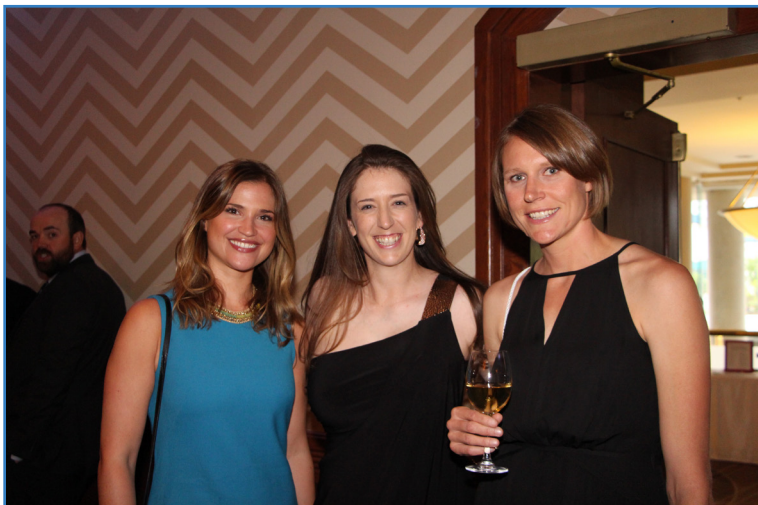
Residents enjoy Surgeons' Day Gala at the Sheraton Eau Claire