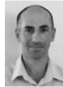
Dr. Avi Rubinov Oculoplastics & Reconstruction Rambam Health Care Centre Israel