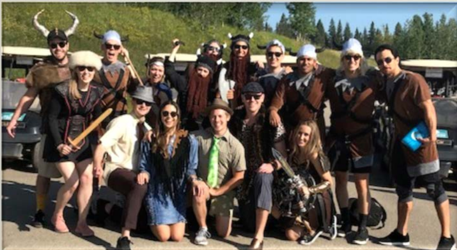
Our Residents – the Villagers and Pillagers!