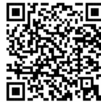
Our Asthma Info in 14 Languages