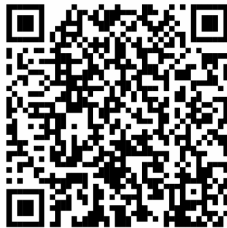
Does My Child have Asthma?