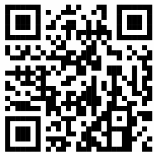
Food Allergy Canada