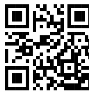
Eczema Society of Canada