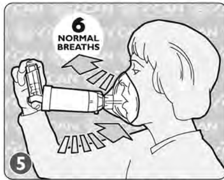
BREATHE IN & OUT