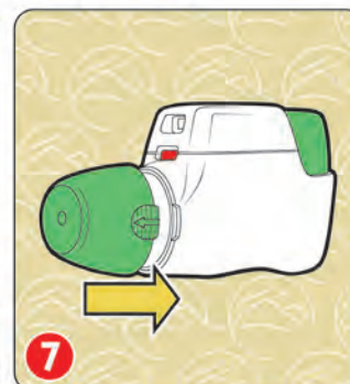
7 REPLACE CAP