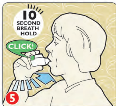
5 STRONG DEEP BREATH IN