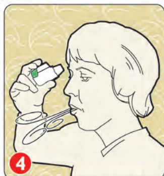
4 BREATHE OUT