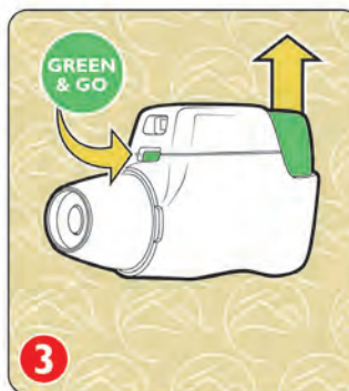
3 RELEASE GREEN BUTTON