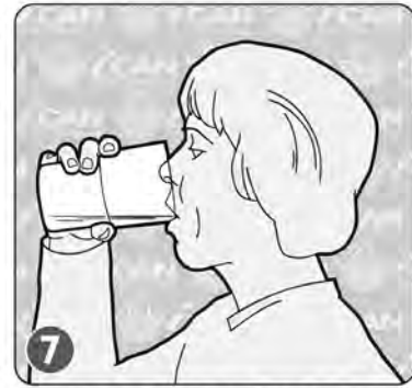
DRINK OR BRUSH TEETH