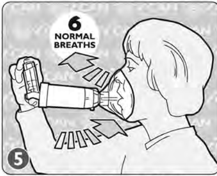
BREATHE IN & OUT