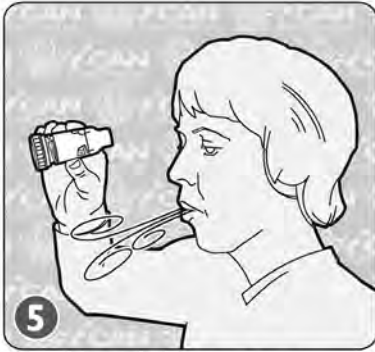
5 BREATHE OUT