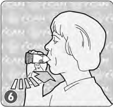
6 DEEP BREATH IN & HOLD