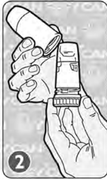
2 TWIST OPEN