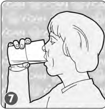
7 RINSE & SPIT