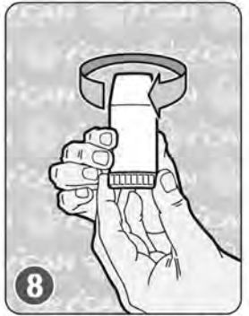
8 TWIST TO CLOSE