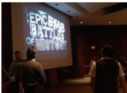
BMB faculty members are stumped by science history