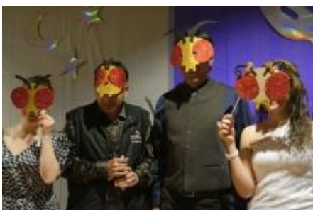
Your typical BMB fly lab