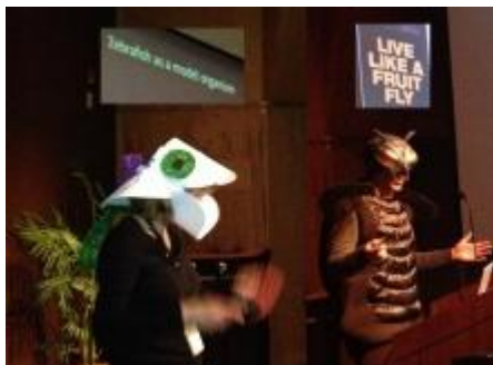
After long hours in the lab, faculty members begin to resemble their model organism