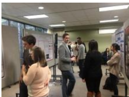
The posters draw a crowd