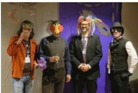
A league of extraordinary professors