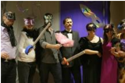
The masquerade party – biochemists have most fun!