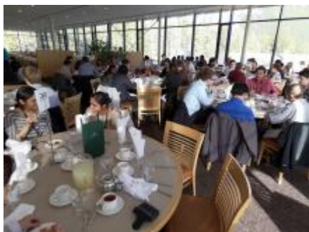
Lunchtime in the Vistas Dining room