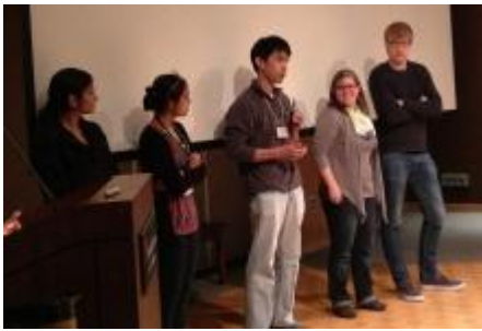
The winning poster presenters give their short "elevator" talks