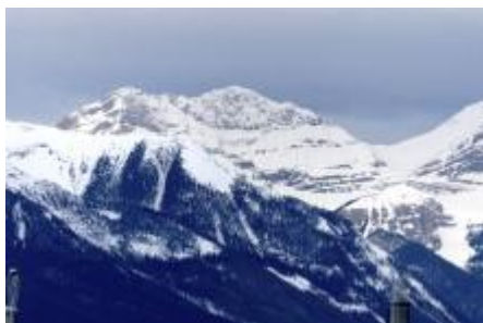
Springtime mountain magnificence in Banff