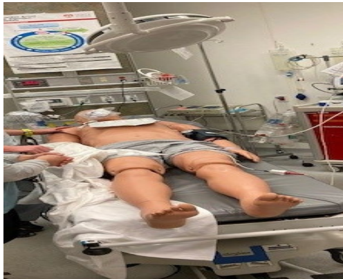
Local education group/ Sims