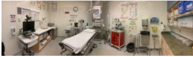
ER Treatment Room