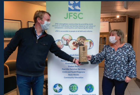
2021 Minister's Senior Service Award in the Nonprofit Organization category

We have experienced challenges and hardships, but we have also witnessed remarkable perseverance, community support, and an impressive commitment that has helped us flourish through this very trying time.