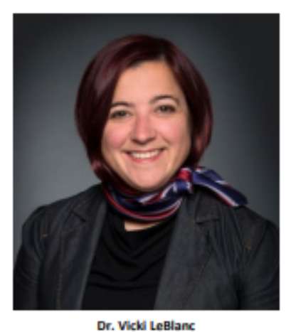
University of Ottawa