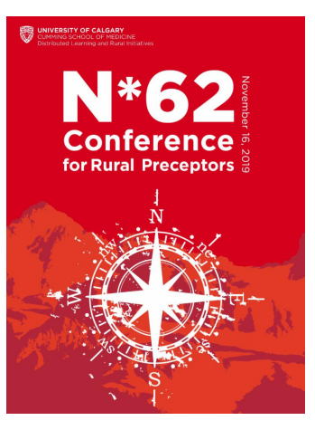
November 16, 2019 Yellowknife, NWT

Development South) September 27-28, 2019 Drumheller, AB