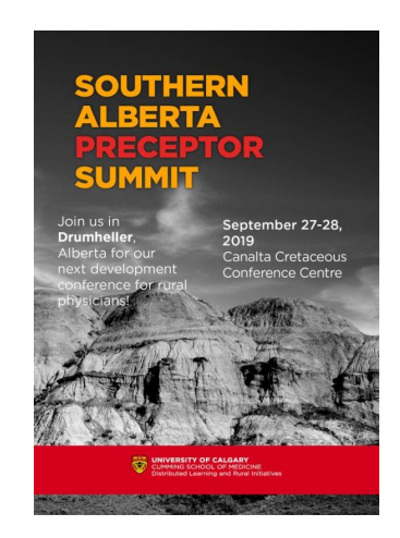
Southern AB Preceptor Summit (Formerly Faculty

Development South) September 27-28, 2019 Drumheller, AB