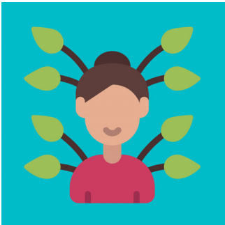
A Personal Development activity (individual)

Tip #1: Before you dive in, take a deep breath. Our most important tip is the same advice we would give a trainee who is embarking on a research project: keep it as simple and as relevant to your practice as possible. Even better, get the most bang for your time-bucks by making it do double duty as suggested below. If your pulse has dropped, read on!