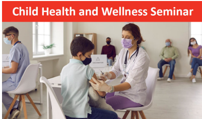
Child Health and Wellness Seminar