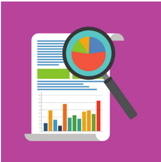
A Practice Quality Improvement activity (group or individual)

This monthly section has been created in response to members of the Department requesting assistance with the Physician Practice Improvement Projects required by the CPSA in order to maintain their licensure. The first 5-year cycle was launched in 2021 and consists of 3 separate projects to be completed in that time: