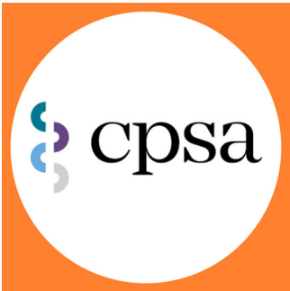
A CPSA Standards of Practice activity (individual)