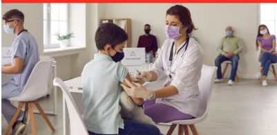
Optimizing immunization while ensuring vaccine safety for special populations

For all events, please visit the Department of Pediatrics calendar All events are in MST (Mountain Standard Time), unless otherwise stated