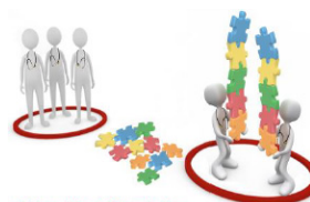
Attending Physician Transition to Practice (T2P)

If you are new to the Department of Medicine since 2018 register for one or more of these sessions when they become available. Register for the October 25, 2021 session 6pm - 8:30pm on zoom. Register Now