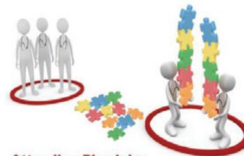
Attending Physician Transition to Practice (T2P)

These moderated sessions provide opportunities to share your experiences as new faculty with your peers and learn from senior colleagues who will share wisdom and practical tips.