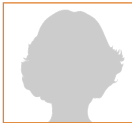
Dr. Martha Decker Long Service Award