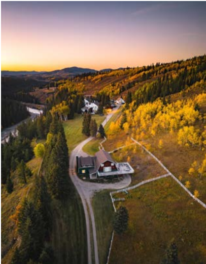
The Crossing at Ghost River Highway 40 (25 minutes NW of Cochrane)