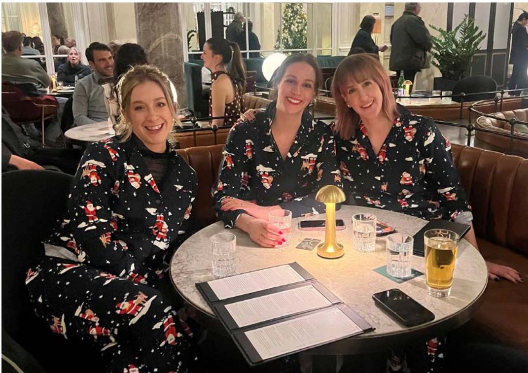
Pajama Party after the DOM Annual Awards Celebration