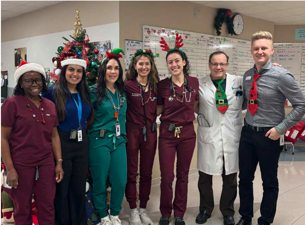
GIM Crew having some fun over the holidays.

Submit your photos to Dom.announcements@ahs.ca